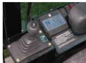
Full power shift transmission with torque converter