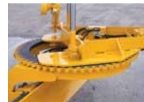
1,339 mm gear driven circle with "A" frame allows 360° blade rotation