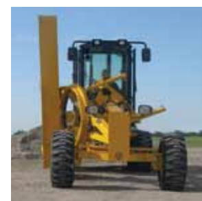
90° Bank slope saddle